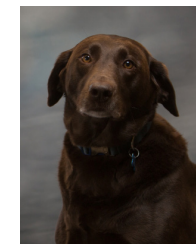
Coco Hospice Dog