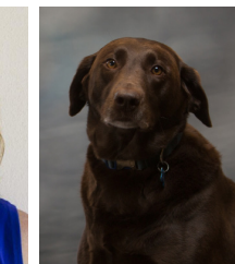
Coco Hospice Dog