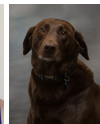
Coco Hospice Dog