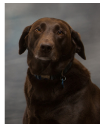
Coco Hospice Dog