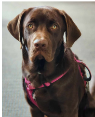
Hershey Hospice Dog